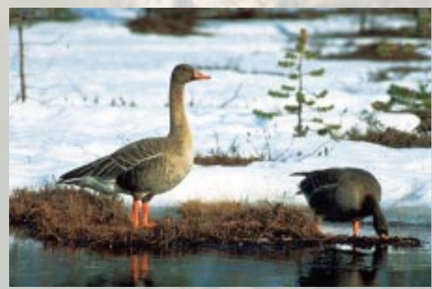
Bean geese (Anser fabalis) on an aapa mire in early spring.

The species representative of the open aapa mire are waterbirds, waders and gulls. The most interesting waterbirds are the 20 pairs of red-throated divers ( Gavia stellata ), and the 30 pairs of bean geese.