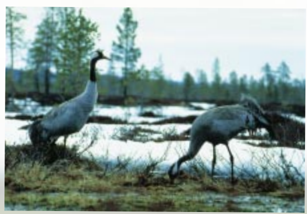
A high proportion of the European crane ( Grus grus ) population breeds on the aapa mires (A. Torvinen).

C ranes, whooper swans ( Cygnus cygnus ) and bean geese ( Anser fabalis ) have made their nests, and the first young may have already hatched, by the time the first broad-billed sandpipers ( Limicola falcinellus ) whir down to the flarks.