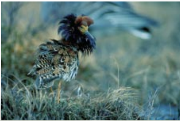
The ruff ( Philomachus pugnax ) is declining in Europe, but it is still abundant in the north (M. Aikioniemi).

The pine and spruce mires along the edges of the aapa mires are habitats favoured by gallinaceous birds. In the winter capercaillies gather to eat pine needles, and black grouse ( Tetrao tetrix ) feed on birch seeds in the edge forests. In the spring, open mires are important lekking areas for black grouse.