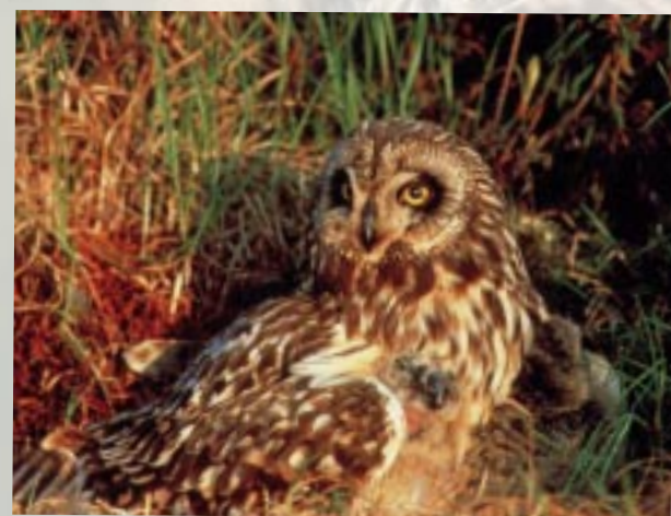
A female short-eared owl (Asio flammeus) is keeping its nestlings warm in the sunset

In April and May thousands of birds arrive from their wintering areas to breed on the northern aapa mires. Ducks have paired off already in their wintering areas. Ruffs ( Philomachus pugnax ) gather in their permanent lekking areas. Many other species of waterbird perform loud, conspicuous displays, especially the cranes ( Grus grus ).