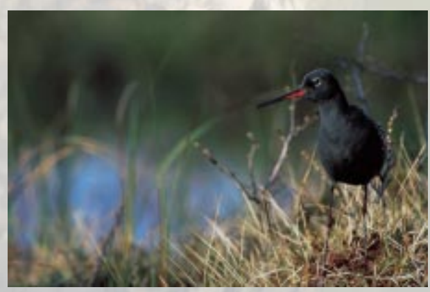
The spotted redshank ( Tringa erytropus ) is a typical species of flarky aapa mires (M.Aikioniemi).

A tower and wooden walkways have been constructed for bird watchers close to the Oulu-Kuusamo road. From the bird-watching tower, an alert watcher may see a hobby (Falco subbuteo) catching wasps or a common buzzard (Buteo buteo) looking for voles. Spotted redshanks, ruffs, golden plovers and wood sandpipers can be seen on the nearby flarks, especially in spring.