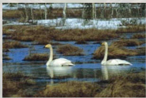
One of the most typical species on aapa mires is the swan ( Cygnus cygnus ), which is also the national bird of Finland (A. Torvinen).

The small-numbered species characteristic of mires include the golden eagle ( Aquila chrysaetos ), the white-tailed eagle ( Haliaeetus albicilla ), the osprey ( Pandion haliaetus ) and the peregrine ( Falco peregrinus ). Eagles breed in the trees in pine and spruce mires along the edges of the aapa. In contrast, the peregrine prefers to breed on wet flark bogs.