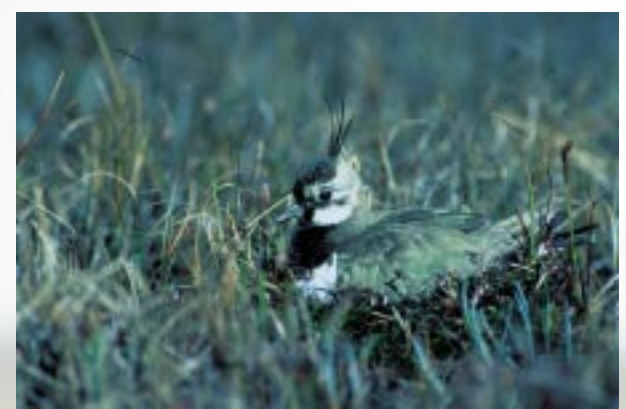
The golden plover ( Vanellus vanellus ) spread to open mires in the 1950's. Its population density is currently on the decrease (M. Aikioniemi).