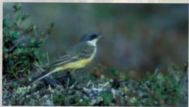
One of most common bird species on aapa mires is the yellow wagtail (Montacilla flava) (M. Aikioniemi).

Waders are a group of birds that is very typical to wet mires. The wood sandpiper ( Tringa glareola ), the common snipe ( Gallinago gallinago ), ruff, curlew, whimbrel ( Numenius phaeopus ), broadbilled sandpiper and lapwing ( Vanellus vanellus ) are the most common wader species.